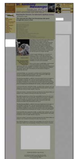
Run of Site