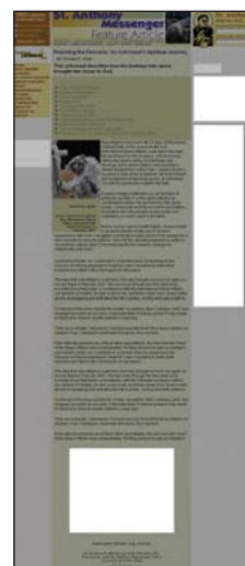
Non-Home-Page Run of Site