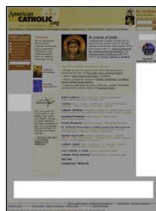
HPO: Home Page Only

These sample pages show all possible ad sizes, shapes and locations available. Pages vary in length according to content.